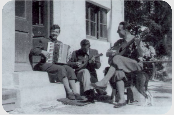
Miners at the entrance to the office in the mining village, 1943.

Gastrointestinal disorders are frequent among the workers. I believe that the irrational meal times are not unrelated to this. In fact, they are too close together. The workers on the morning shift (6 a.m – 2 p.m) take a coffee substitute with bread before entering the mine, a main meal when leaving, around 2:15 p.m, the final meal in the evening around 6:30 p.m. The workers on the evening shift (18-2) take a coffee substitute with bread when leaving the mine, a main meal around 12:00, and the final meal around 5:00 p.m".