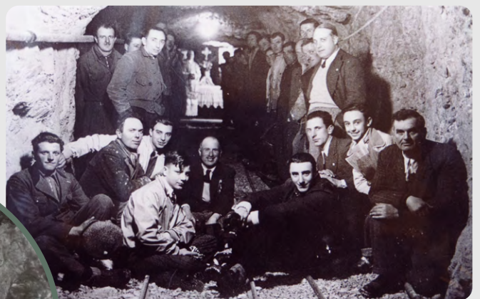
Miners in the tunnel during a religious service for the patron saint of miners (St. Barbara)